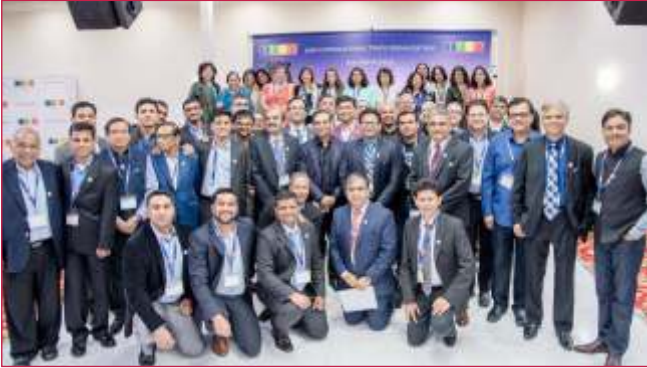
JITO USA SAN FRANCISCO CHAPTER LAUNCH