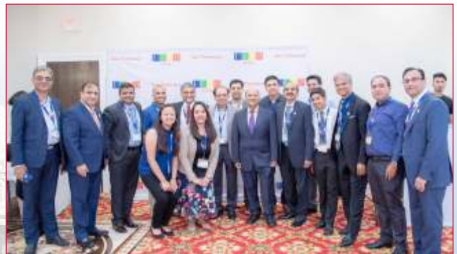
JITO USA SAN FRANCISCO CHAPTER LAUNCH