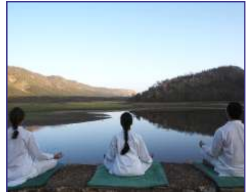
Social / Wellness Retreat