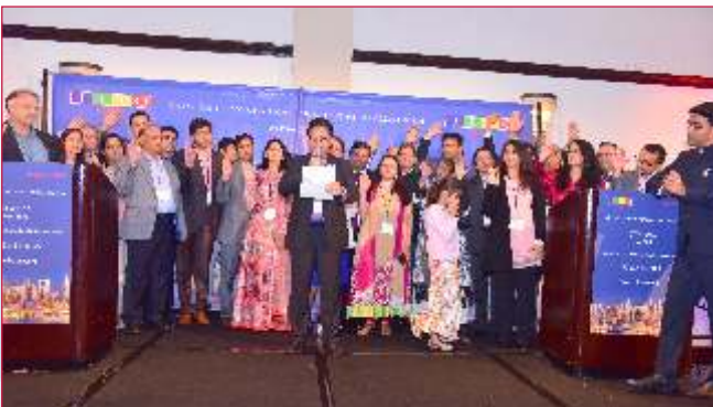
JITO USA NEW YORK PROFESSIONAL & INDUSTRY WINGS