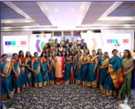
Ladies Wing Meet