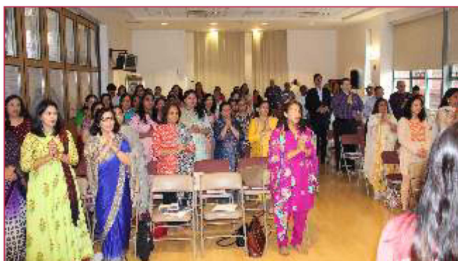
JITO USA NEW YORK WOMEN'S FORUM