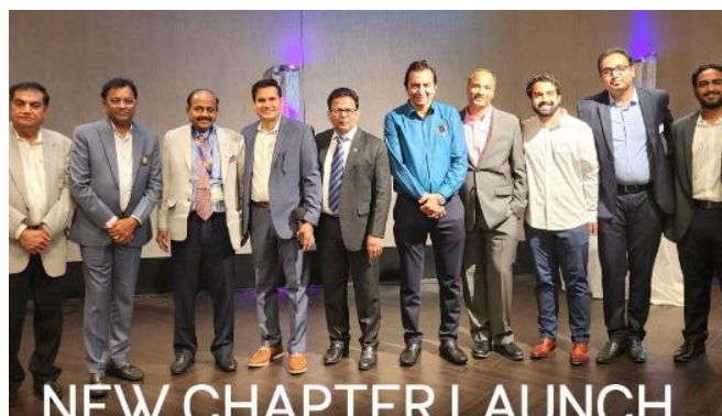
Dallas Chapter Launch