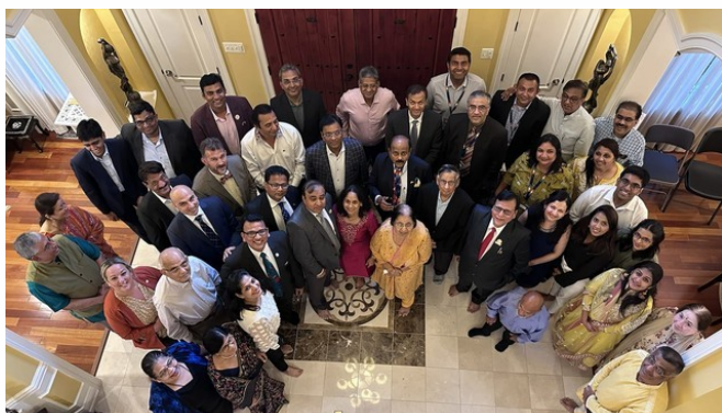
Washington DC Chapter Launch