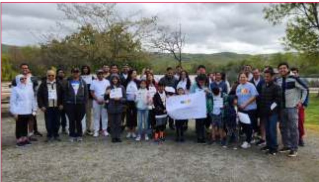
JITO USA AHIMSA WALK-RUN & JITO FOUNDATION DAY