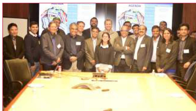
JITO USA SAN FRANCISCO: THE EXECUTIVE FORUM (JEF)