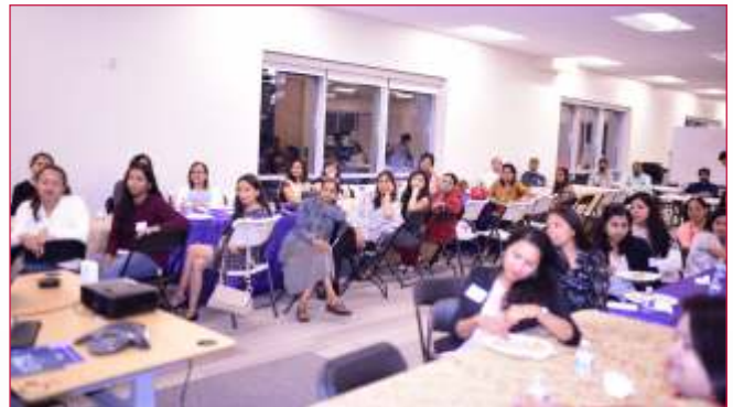
JITO USA SF WOMEN'S FORUM (JWF)