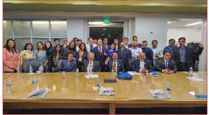
MEET & GREET LEADERSHIP