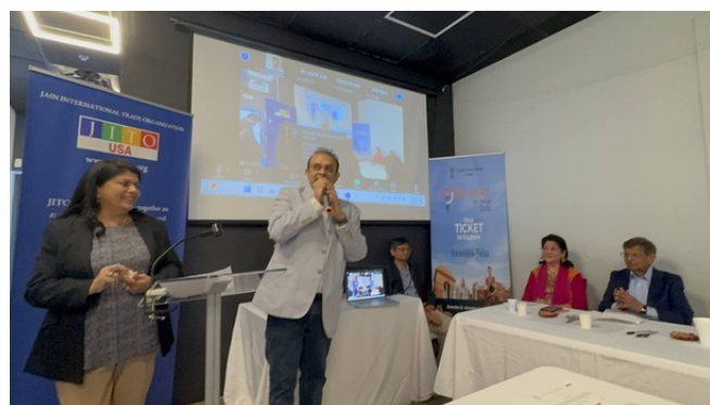
Atlanta Chapter Launch