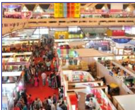
Trade Fair / Business Delegations